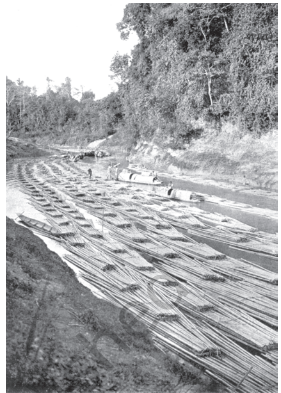
Fig.4 – Bamboo rafts being floated down the Kassalong river, Chittagong Hill Tracts.

From the 1860s, the railway network expanded rapidly. By 1890, about 25,500 km of track had been laid. In 1946, the length of the tracks had increased to over 765,000 km. As the railway tracks spread through India, a larger and larger number of trees were felled. As early as the 1850s, in the Madras Presidency alone, 35,000 trees were being cut annually for sleepers. The government gave out contracts to individuals to supply the required quantities. These contractors began cutting trees indiscriminately. Forests around the railway tracks fast started disappearing.