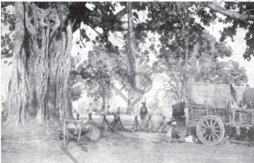
Fig.19 – Army camp in Bastar, 1910.

In 1947 Bastar kingdom was merged with Kanker kingdom and become Bastar district in Madhya Pradesh. In 1998 it was divided again into three districts, Kanker, Bastar and Dantewada. In 2001, these became part of Chhattisgarh. The 1910 rebellion first started in the Kanger forest area (encircled) and soon spread to other parts of the state.