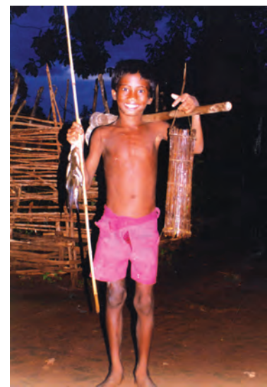
Fig. 17 – The little fisherman. Children accompany their parents to the forest and learn early how to fish, collect forest produce and cultivate. The bamboo trap which the boy is holding in his right hand is kept at the mouth of a stream – the fish flow into it.

While the forest laws deprived people of their customary rights to hunt, hunting of big game became a sport. In India, hunting of tigers and other animals had been part of the culture of the court and nobility for centuries. Many Mughal paintings show princes and emperors enjoying a hunt. But under colonial rule the scale of hunting increased to such an extent that various species became almost extinct. The British saw large animals as signs of a wild, primitive and savage society. They believed that by killing dangerous animals the British