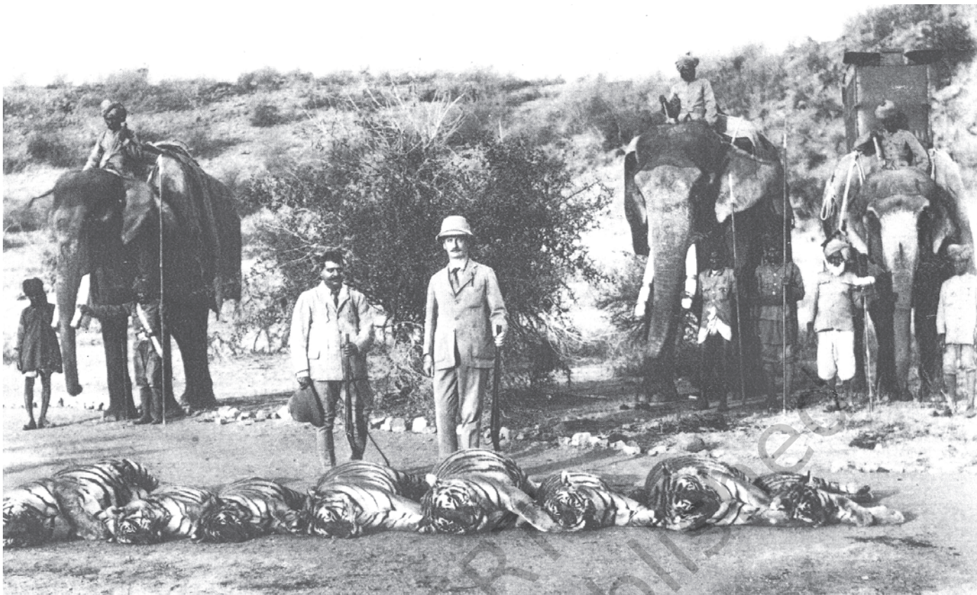
Fig. 18 – Lord Reading hunting in Nepal.

Count the dead tigers in the photo. When British colonial officials and Rajas went hunting they were accompanied by a whole retinue of servants. Usually, the tracking was done by skilled village hunters, and the Sahib simply fired the shot.