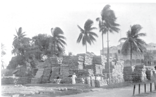
Fig.23 – Indian Munitions Board, War Timber Sleepers piled at Soolay pagoda ready for shipment, 1917.

The Allies would not have been as successful in the First World War and the Second World War if they had not been able to exploit the resources and people of their colonies. Both the world wars had a devastating effect on the forests of India, Indonesia and elsewhere. The forest department cut freely to satisfy war needs.