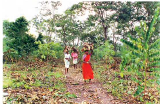
Fig.6 - Women returning home after collecting fuelwood.