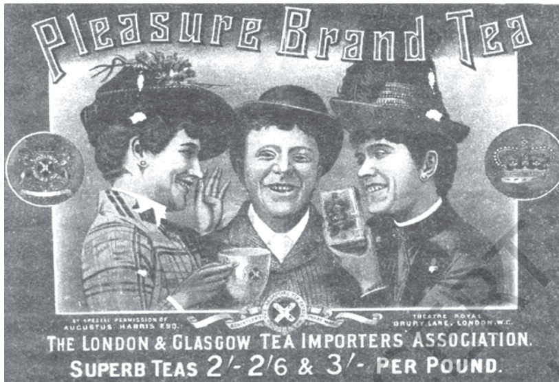
Fig. 8 – Pleasure Brand Tea.

Large areas of natural forests were also cleared to make way for tea, coffee and rubber plantations to meet Europe's growing need for these commodities. The colonial government took over the forests, and gave vast areas to European planters at cheap rates. These areas were enclosed and cleared of forests, and planted with tea or coffee.