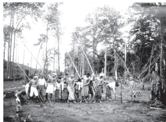
Fig. 15 – Taungya cultivation was a system in which local farmers were allowed to cultivate temporarily within a plantation. In this photo taken in Tharrawaddy division in Burma in 1921 the cultivators are sowing paddy. The men make holes in the soil using long bamboo poles with iron tips. The women sow paddy in each hole.

Children living around forest areas can often identify hundreds of species of trees and plants. How many species of trees can you name?