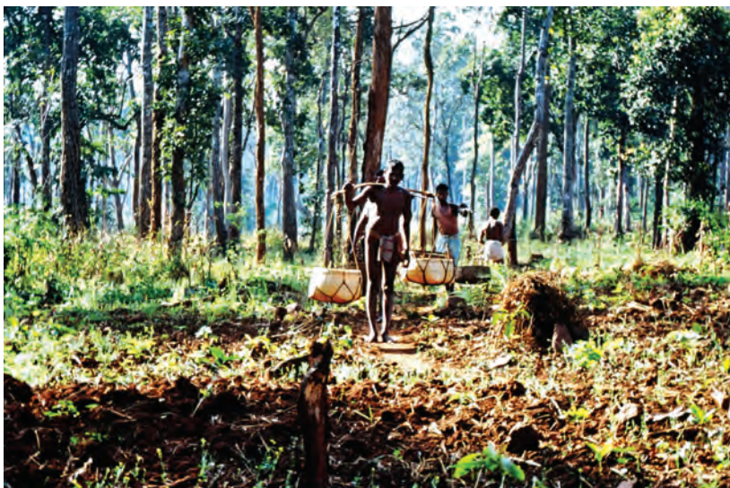
Fig. 14 – Bringing grain from the threshing grounds to the field.

The men are carrying grain in baskets from the threshing fields. Men carry the baskets slung on a pole across their shoulders, while women carry the baskets on their heads.