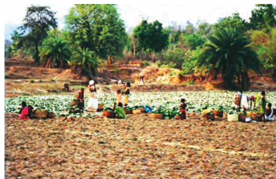
Fig. 13 – Drying tendu leaves.

The Forest Act meant severe hardship for villagers across the country. After the Act, all their everyday practices – cutting wood for their