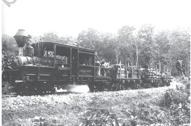
Fig.21 – Train transporting teak out of the forest – late colonial period.

As in India, the need to manage forests for shipbuilding and railways led to the