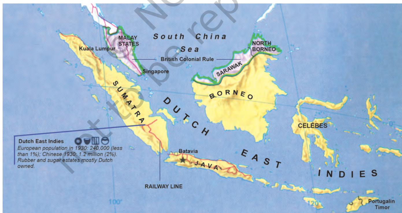
Fig. 22 – Most of Indonesia's forests are located in islands like Sumatra, Kalimantan and West Irian. However, Java is where the Dutch began their 'scientific forestry'. The island, which is now famous for rice production, was once richly covered with teak.

Dirk van Hogendorp, cited in Peluso, Rich Forests, Poor People , 1992.