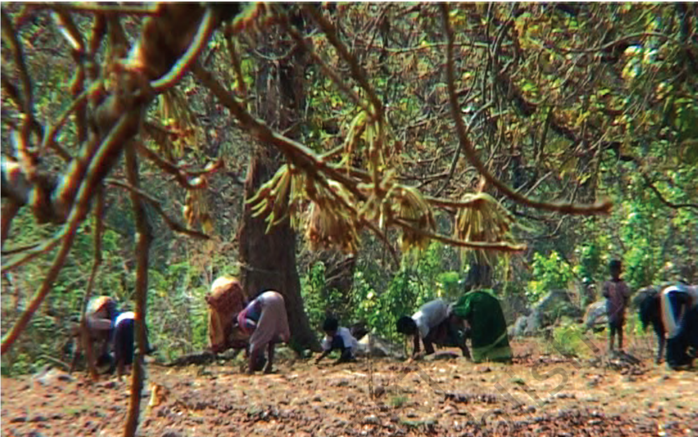
Fig. 12 – Collecting mahua ( Madhuca indica ) from the forests.

Villagers wake up before dawn and go to the forest to collect the mahua flowers which have fallen on the forest floor. Mahua trees are precious. Mahua flowers can be eaten or used to make alcohol. The seeds can be used to make oil.