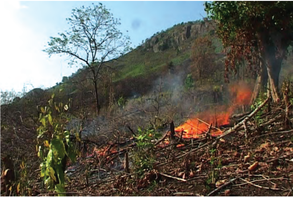
Fig. 16 – Burning the forest penda or podu plot. In shifting cultivation, a clearing is made in the forest, usually on the slopes of hills. After the trees have been cut, they are burnt to provide ashes. The seeds are then scattered in the area, and left to be irrigated by the rain.

Shifting cultivation also made it harder for the government to calculate taxes. Therefore, the government decided to ban shifting cultivation. As a result, many communities were forcibly displaced from their homes in the forests. Some had to change occupations, while some resisted through large and small rebellions.