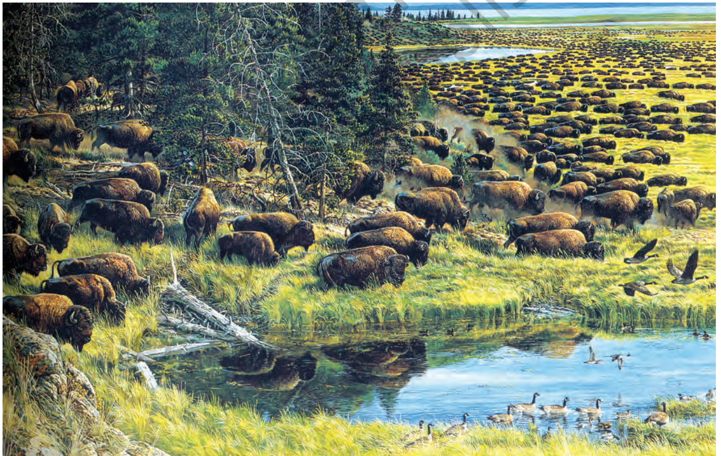
Fig. 2 – When the valleys were full. Painting by John Dawson. Native Americans like the Lakota tribe who lived in the Great North American Plains had a diversified economy. They cultivated maize, foraged for wild plants and hunted bison. Keeping vast areas open for the bison to range in was seen by the English settlers as wasteful. After the 1860s the bisons were killed in large numbers.

In 1600, approximately one-sixth of India's landmass was under cultivation. Now that figure has gone up to about half. As population increased over the centuries and the demand for food went up, peasants extended the boundaries of cultivation, clearing forests and breaking new land. In the colonial period, cultivation expanded rapidly for a variety of reasons. First, the British directly encouraged