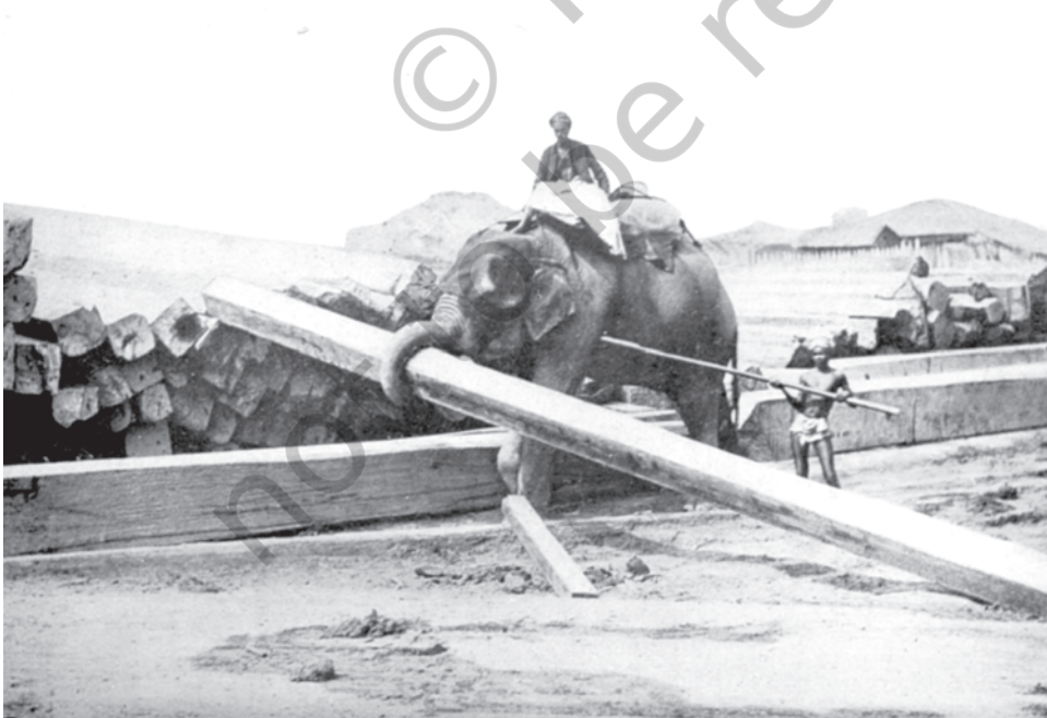
Fig.5 – Elephants piling squares of timber at a timber yard in Rangoon. In the colonial period elephants were frequently used to lift heavy timber both in the forests and at the timber yards.