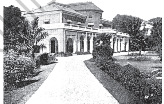
Fig. 11 – The Imperial Forest School, Dehra Dun, India. The first forestry school to be inaugurated in the British Empire.

Foresters and villagers had very different ideas of what a good forest should look like. Villagers wanted forests with a mixture of species to satisfy different needs – fuel, fodder, leaves. The forest department on the other hand wanted trees which were suitable for building