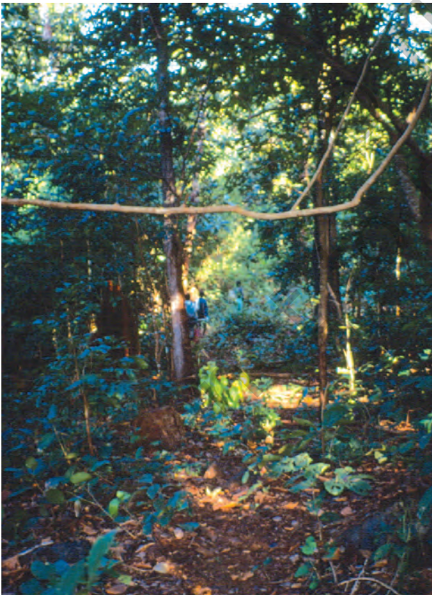
Fig. 1 – A sal forest in Chhattisgarh.

A lot of this diversity is fast disappearing. Between 1700 and 1995, the period of industrialisation, 13.9 million sq km of forest or 9.3 per cent of the world's total area was cleared for industrial uses, cultivation, pastures and fuelwood.