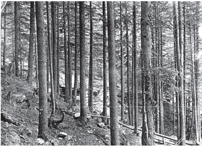
Fig. 10 – A deodar plantation in Kangra, 1933.

punished. So Brandis set up the Indian Forest Service in 1864 and helped formulate the Indian Forest Act of 1865. The Imperial Forest Research Institute was set up at Dehradun in 1906. The system they taught here was called ‘ scientific forestry ’. Many people now, including ecologists, feel that this system is not scientific at all.