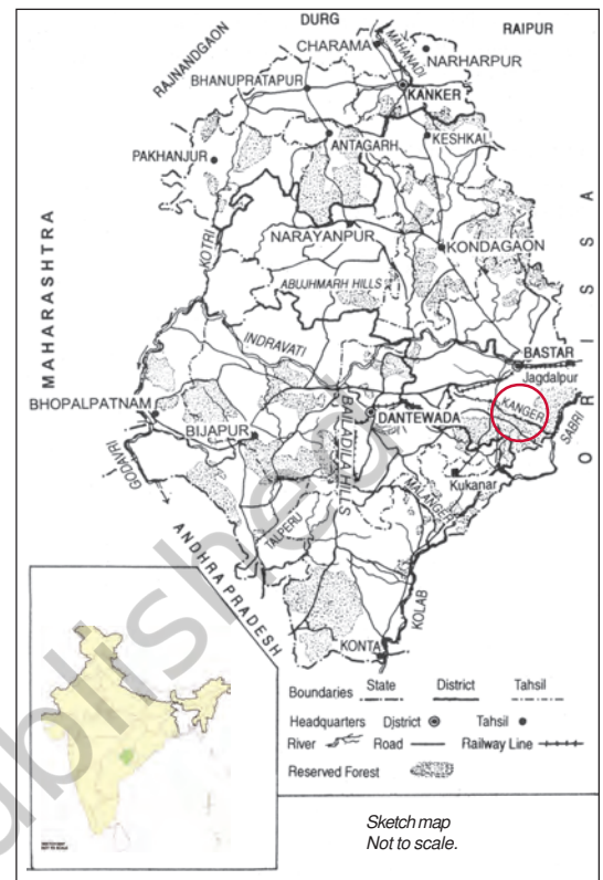
Fig.20 – Bastar in 2000.

Bastar is located in the southernmost part of Chhattisgarh and borders Andhra Pradesh, Orissa and Maharashtra. The central part of Bastar is on a plateau. To the north of this plateau is the Chhattisgarh plain and to its south is the Godavari plain. The river Indrawati winds across Bastar east to west. A number of different communities live in Bastar such as Maria and Muria Gonds, Dhurwas, Bhatras and Halbas. They speak different languages but share common customs and beliefs. The people of Bastar believe that each village was given its land by the Earth, and in return, they look after